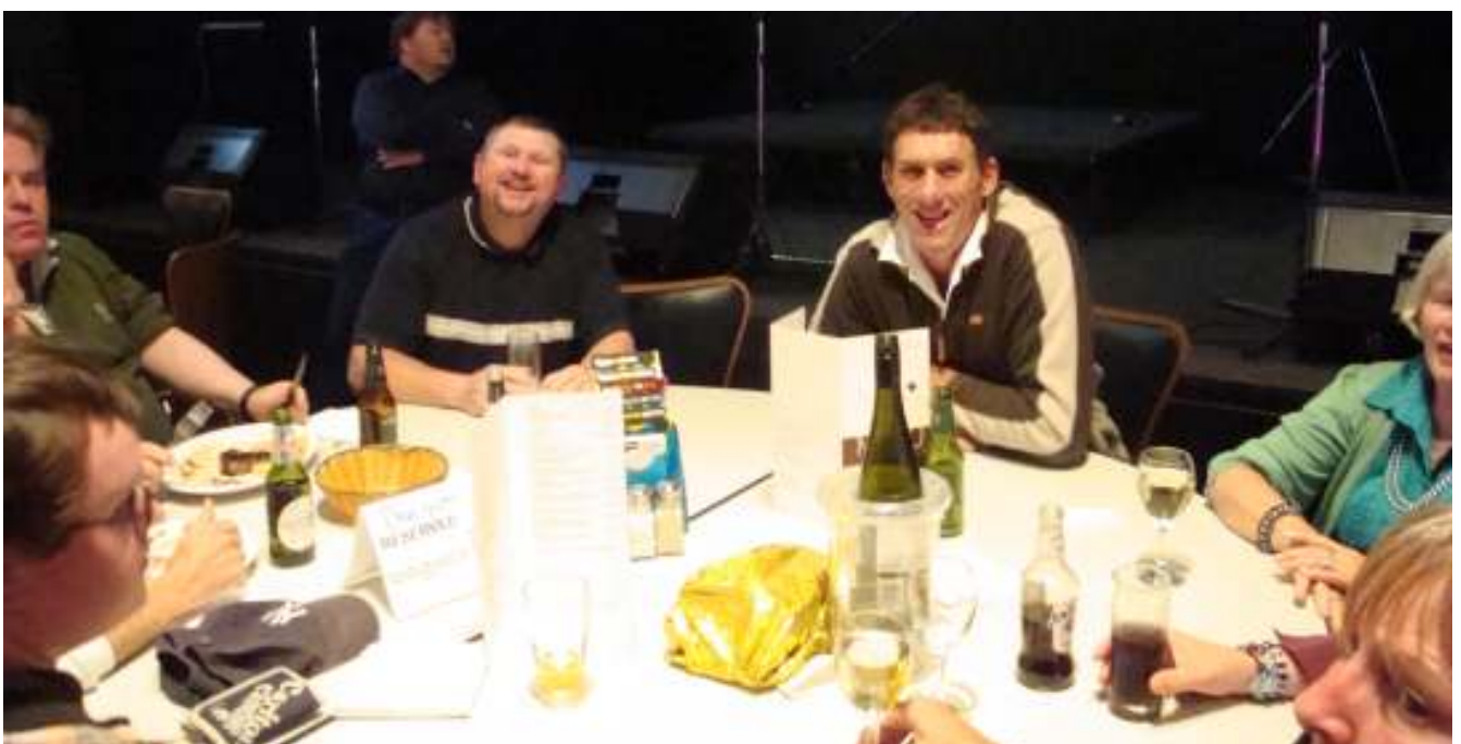
Bluegum Christmas function